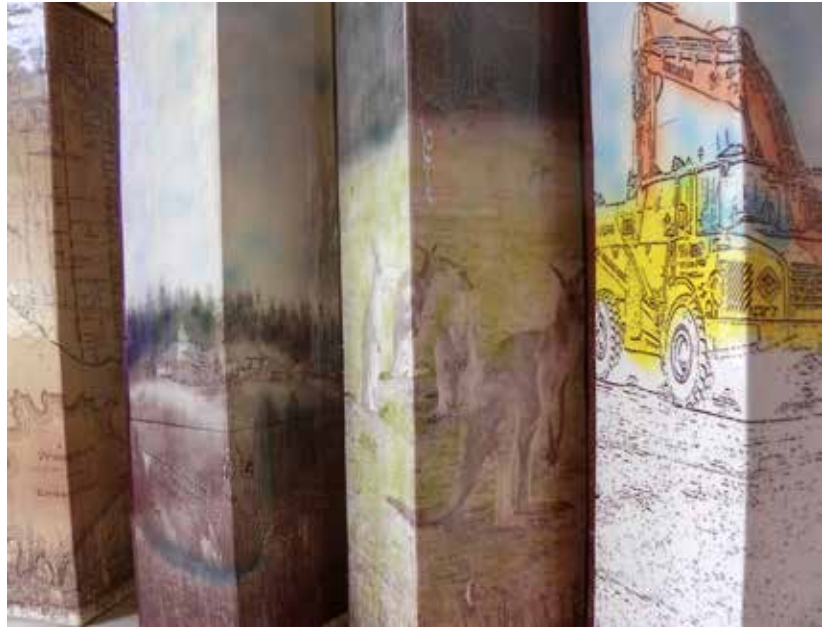
Bungaribee and the spirit of the ghost gums , 2014 Ceramics underglazed and laser decals 52 x 12.5 x 12.5 cm