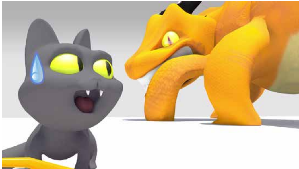
Juno's Nine Lives , 2014 Digital Video 1920 x 720 px