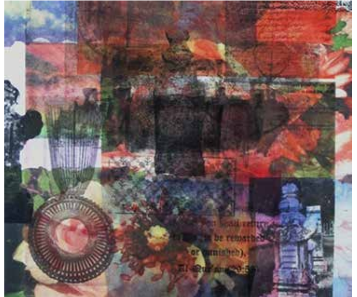
Layers of Context 3 (detail), 2014 Transfer image on paper 76 x 56.5 cm