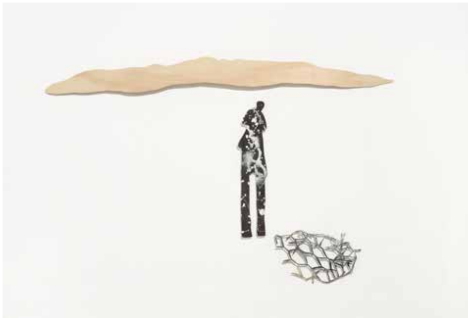
walking at weereewa , 2012 paper and marine ply cutout installation, ink, watercolour 55 x 70 x 5 cm