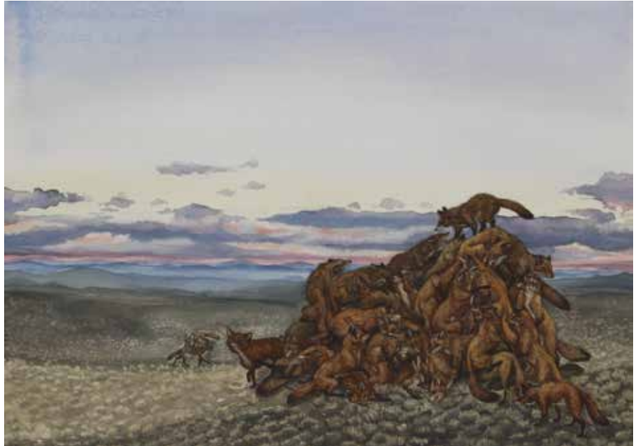
Foxes , 2014 Watercolour and gouache on watercolour paper 38 x 28 cm