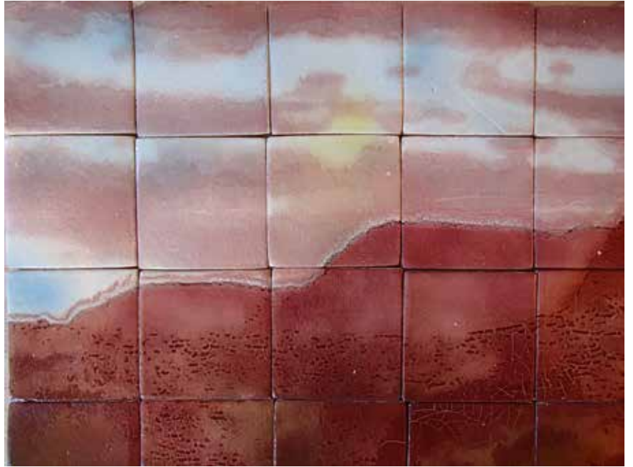
Kata Tjuta (Olgas) , 2014 Ceramics underglazed and laser decals 60 x 90 x 2.5 cm