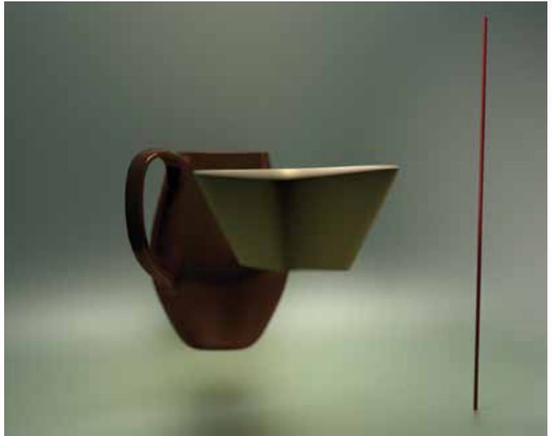
jug and vessel, 2014 inkjet print 61 x 76 cm