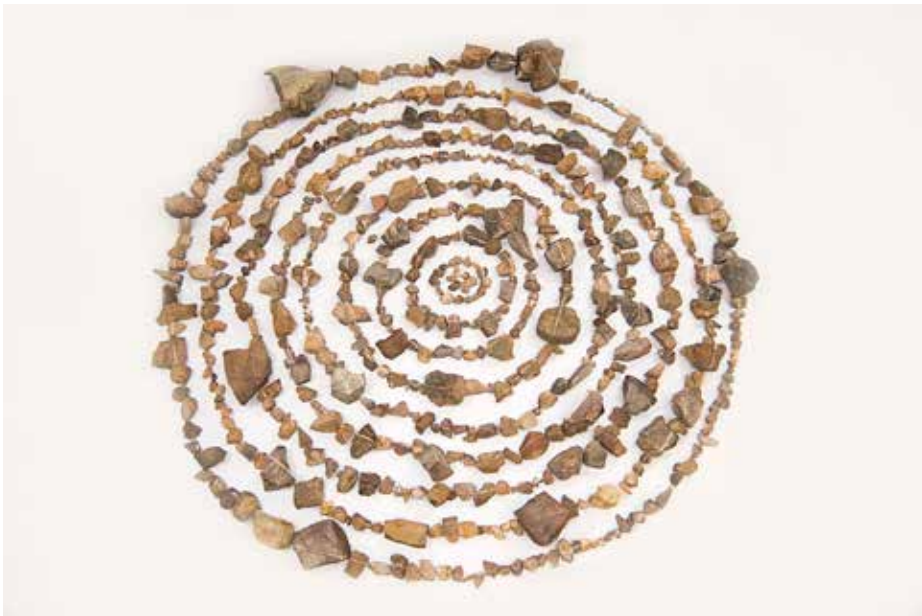
Lay , 2014 found rocks 200 x 200 x 20 cm