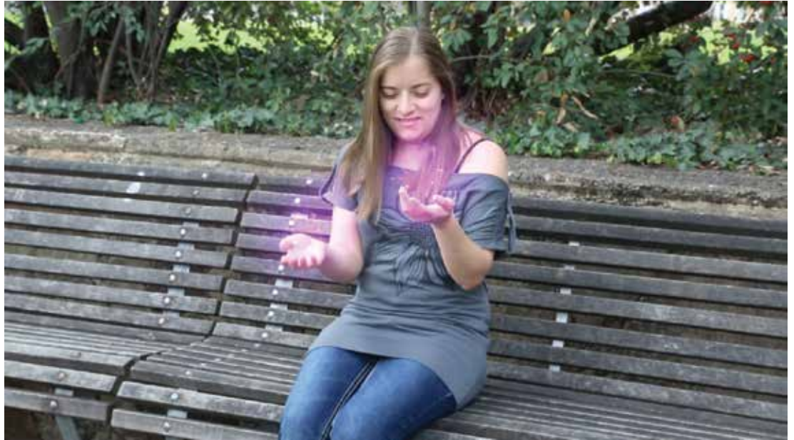
The Unexpected 2 , 2014 Short Film 12 x 6.73 cm