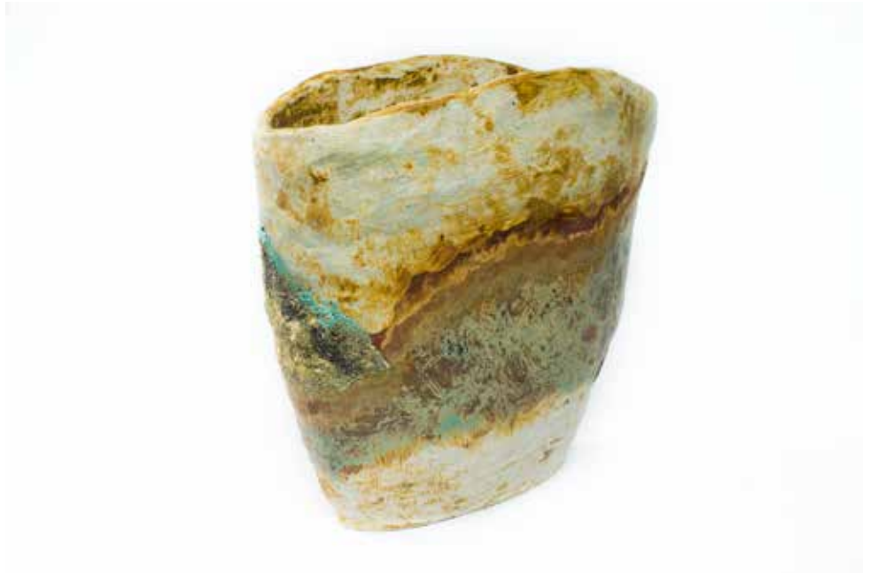
Hidden valley , 2014 Terracotta and stoneware clay, dry glazes 70 x 60 x 30 cm