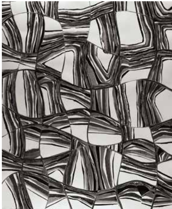
Untitled 254-5, 2014 unique silver gelatine chemigram 50.8 x 60.96 cm